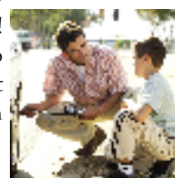
A Father is someone you look up to, no matter how tall you get!

If you’re interested in helping in the areas of prayer or worship, please don’t hesitate to contact the church office and learn of the opportunities to serve the body of Christ and the city of Salt Lake City.